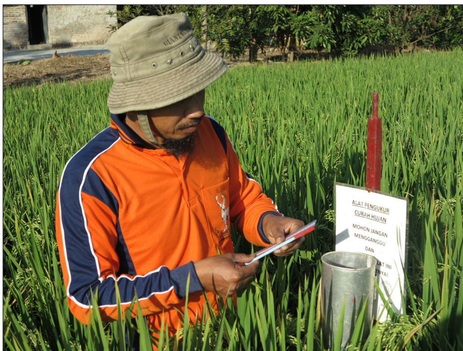
Figure 1. A farmer is measuring rainfall. (photo by Aria S. Handoko).

The first thing all participating farmers have to learn is measuring the rainfall on their plots on a daily basis. This quantitative data is exchanged and discussed on a monthly basis in the SFSs meeting. Thereby, farmers understand how the rainfall varies through time and space. Rain gauges serve as KTCTs as they are used to exchange and discuss the data gathered (see Figure 1).