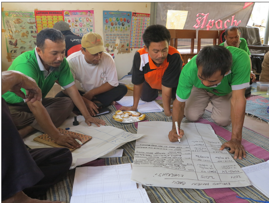
Figure 3. Group of rainfall observers discussing their agrometeorological observations. (photo by Yunita T. Winarto).

ery, and knowledge). Farmers communicate and discuss the procurement of yields among themselves. Moreover, they compare yield, rainfall, and other data with those from previous seasons. The analysis, understanding, and comparison of yields are part of KTCTs.