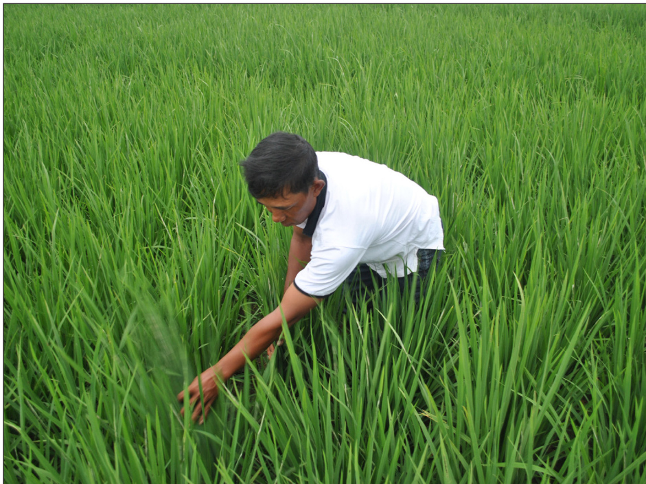
Figure 2. A farmer is observing the agroecosystem condition of his field.