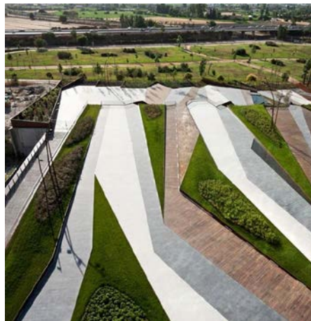
Figure (3) Shows us how we depend on modern materials and new thinking in design

This factor includes several elements from one era to another and from one society to another and it consists of building materials and the techniques followed during construction along with scientific and technological methods. Building materials and construction methods affect the shape and structure of architectural spaces and this is evident in a new building if it reflects the magnitude of its development in its modern building materials, construction methods, and technological techniques. That is also evident when it comes to its large size along with its color and texture (12).