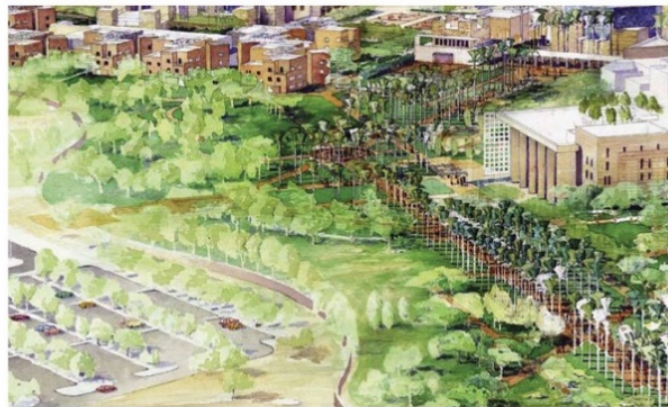
Figure (8) Coordination between different site in entertainment areas and parking facilities and residential buildings