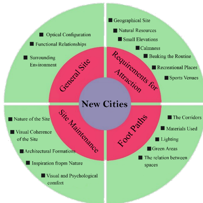
Figure 1 shows the layout of the point of attractions in new cities