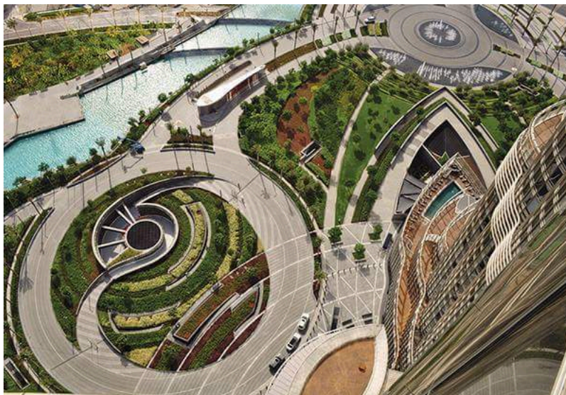
Figure (2) This innovative design illustrates the application of the thought of organic design in the open areas