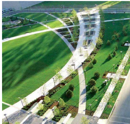
Figure (4) This is the design of one of the open areas between the units urban area were employed plants of different colors and artwork, and environmental and natural materials to create a unique visual spectacle.

Encourage the spread of works of art in the urban spaces of the city provided that it represents a high level of thought and art and enhances the surrounding environment (13).