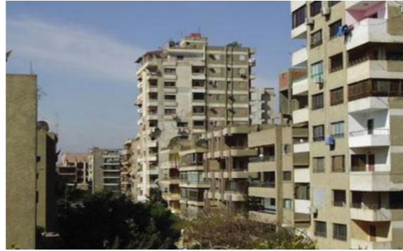
Figure (1) describes the cement forests of the city and the lack of respect for the green areas and privacy of the population along with the lack of interest in protecting public spaces and taking care of building fronts