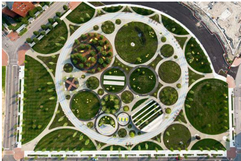
Figure (9) One of the open spaces between the residential area and has been taking into account the different values in the Fine Design