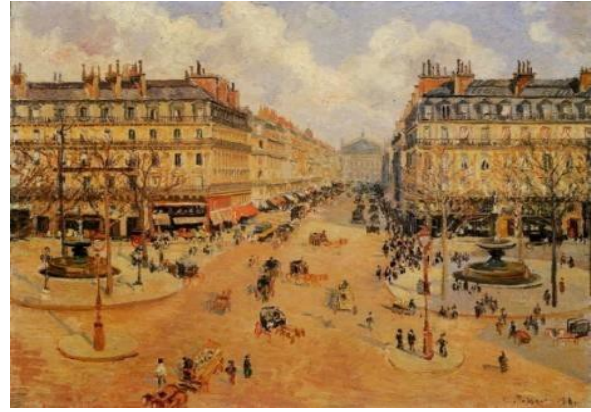
Fig. 11 Avenue de l'Opera, Morning Sunshine - by 1897 - 964 × 779cm