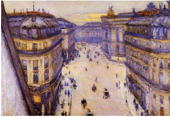
Fig. 10 Rue Halévy, vue d'un sixième étage 1878 oil on canvas 60 × 73 cm