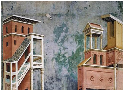
Fig. 4 (detail) Legend of St Francis appearance 1297 - 1299 fresco - 270 cm x 230 cm