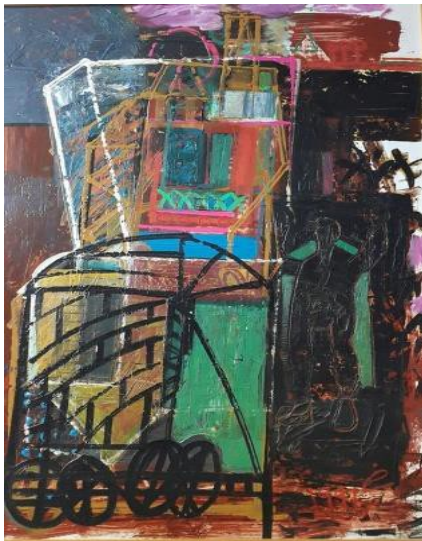
Fig. 26 The rhythm of life in the city 2 Oil painting on Cardboard 100x70 -1991

In the same way, Cairo, the capital of Egypt has inspired many artists since the French Expedition between (1798 -1801), when artists painted every detail in the 'Description of Egypt' book. Moreover, contemporary painters depicted Cairo in many ways, where some of them were interested in the details, the architectural composition, the architectural diversity of styles and its sense of rich history. Other painters paid attention to the life in the city that does not sleep. Reda Abdel Salam's abstract expressionism paintings summarized life in the city with its hustle and its beauty. He expressed the rhythm of life and its frequency in a hard mix of color (Fig. 26). While in an atmosphere of mystical realism, Mahmoud Bakshesh shortened the forms of his city, and turned it into shades. The colors are luminous and cool at the same time, as his cities were dominated by dormancy and silence (عز الدين نجيب, 2007). As we see in his painting 'City and barriers' (Fig. 27), it is depicting a view of a city from afar and the buildings are almost barely visible, while the desert colors are blurry. He presented a city imprisoned in iron barricades.