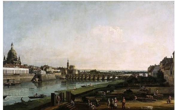
Fig. 9 Dresden from the Right Bank of the Elbe, 1747 oil on canvas 132 cm x 236 cm