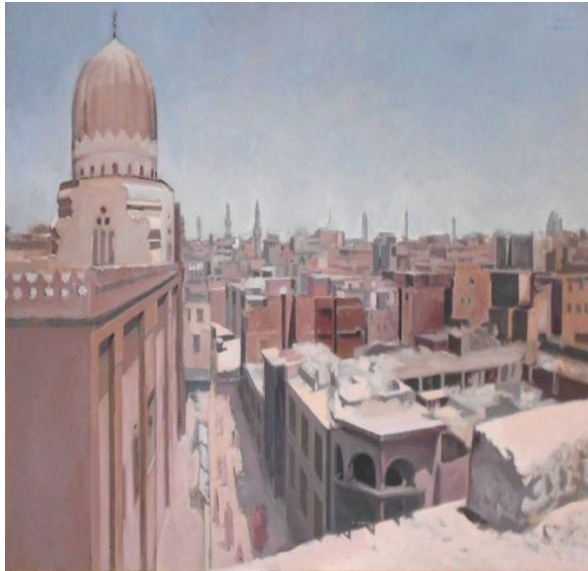
Fig. 28 Oil painting on canvas 2000