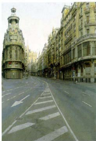
Fig. 19 Grand Via by Antonio López García, 1974-1981, 500 x 522