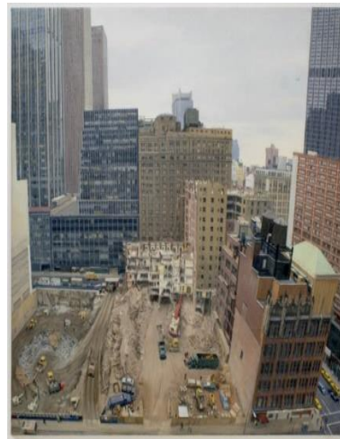
Fig. 18 Demolition and excavation on the site 1983- oil on canvas – 81.28x91.44cm