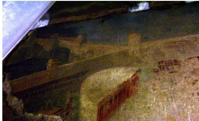
Fig. 1 (detail) the Baths of Trajan

recreational and social center by Roman citizens, both men and women; (Fig. 1) depicts a view of a city by bird's eye perspective, in which we can see clearly: theaters – temples – statues – houses and a series of canals. It possibly shows an imaginary type of an ideal city (Old News, 2013). The theme of the fresco is unusual because classical wall painting tended to represent rural landscapes, not city streets.