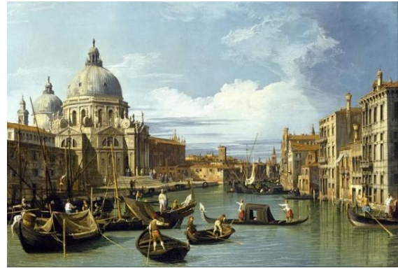
Fig. 7 the Entrance to the Grand Canal, 1730 oil on canvas Painting 49.6 cm x 73.6 cm