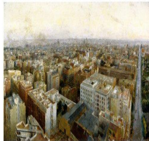
Fig. 20 View of Madrid from Martínez Campos 1960, oil painting on board, 48 x 96 oilpainting