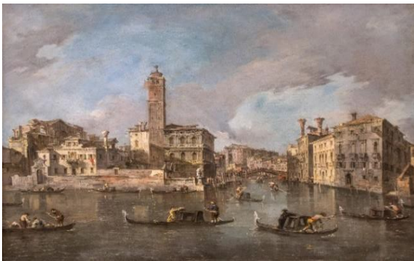
Fig. 8 View on the Grand Canal at San Geremia, Venice(1760-65)