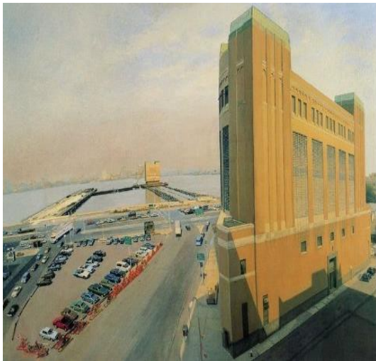
Fig. 17 Ventilation Tower with Estivating Snow Plows, 1988