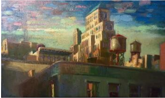
Fig. 24 city sky 2017 oil on panel 24 x 36 inches