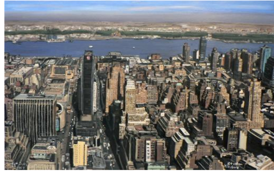
Fig. 25 Manhattan Skyline from top of Empire State- oil on canvas 765 x 573 cm

In the same way, Cairo, the capital of Egypt has inspired many artists since the French Expedition between (1798 -1801), when artists painted every detail in the 'Description of Egypt' book. Moreover, contemporary painters depicted Cairo in many ways, where some of them were interested in the details, the architectural composition, the architectural diversity of styles and its sense of rich history. Other painters paid attention to the life in the city that does not sleep. Reda Abdel Salam's abstract expressionism paintings summarized life in the city with its hustle and its beauty. He expressed the rhythm of life and its frequency in a hard mix of color (Fig. 26). While in an atmosphere of mystical realism, Mahmoud Bakshesh shortened the forms of his city, and turned it into shades. The colors are luminous and cool at the same time, as his cities were dominated by dormancy and silence (عز الدين نجيب, 2007). As we see in his painting 'City and barriers' (Fig. 27), it is depicting a view of a city from afar and the buildings are almost barely visible, while the desert colors are blurry. He presented a city imprisoned in iron barricades.