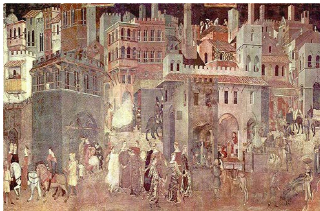
Fig. 5 The Allegory of Good Government -1338 - 1339 -200x770 cm fresco