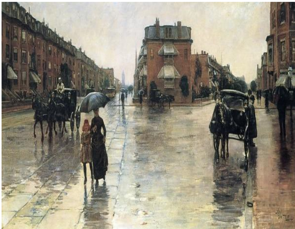
Fig. 12 Rainy Day