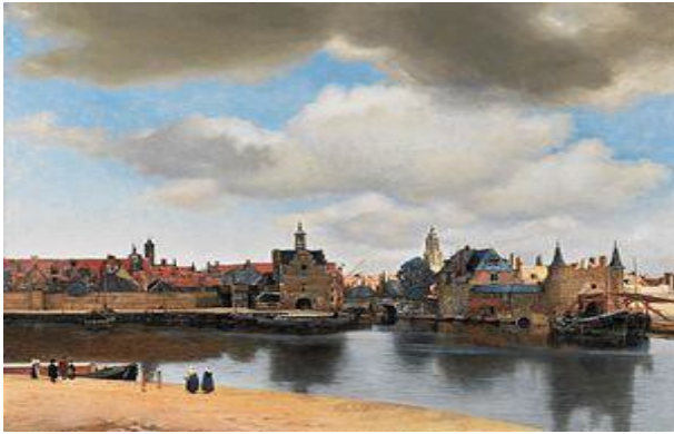
Fig. 6 'View of Delft' 1660-1661 Oil on canvas 96.5 cm × 115.7 cm

From the 16th up to the 18th century, numerous works were made showing cities in a bird's eye view or from a high angle as if seen by a flying bird. However, in the middle of the 17th century, the cityscape became a separated subject such as the 'View of Delft' by Jan Vermeer, ( Fig. 6 ) which shows a portrait of a city in western Holland. By following the Dutch example, cities became subjects for European painters and a very popular subject for cityscape painters. The flourishing time of the Cityscape Painting was the 18th century by Giovanni Antonio Canaletto's 'The Entrance to the Grand Canal, Venice' (Fig.7). Canaletto is said to be an artist who could "make the sun shine in his paintings" (W., 2015) . Two of the most talented followers were Francesco Guardi's 'View on the Grand Canal at San Geremia' (Fig. 8) and Bernardo Bellotto Dresden's from the Right Bank of the Elbe (Fig. 9).