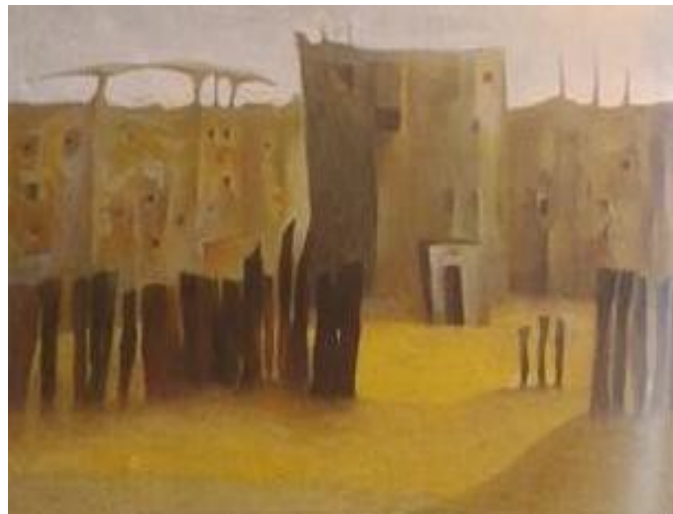
Fig. 27 City and barriers - oil painting -75x60 cm -1986

In a completely different point of view, we find paintings of Zahran Salama offer a study filled with details nearest to the photorealism. His city was soaked in an atmosphere filled with history and modernity, which we can see in his painting (Fig.28). In the same approach, we find Nabil Metwally, who was inspired by ancient Cairo, especially the archeological-like appearance of the aesthetics, and where ancient buildings belong to several historical eras mixed with contemporary human life (Fig.29).