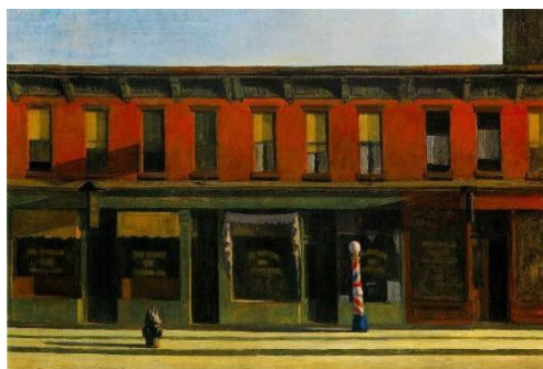
Fig. 16 Early Sunday Morning 1930

Edward Hopper was one of the most important realist painters, and was the only one who created intriguing paintings of the American streets scene. He had a unique and selective vision when portraying an empty cityscape, while capturing the mood and the feeling of the 20th century such as 'Early Sunday Morning' (Fig.16), a painting of a peaceful scene of a closed small business. His painting appears as a picture of New York or an image of America. He had painted the architecture of the buildings to look like basic industries such as selling shoes and clothes. The dark passage in the upper-right corner of the picture is the large side of the building next to the sunny block (Edward Hopper, n.d.). Hopper said that he is "always using nature as the medium to try to project upon canvas my most intimate reaction to the subject as it appears when I like it most; when the facts are given unity by my interests and prejudices. Why I select certain subjects rather than others, I do not exactly know unless it is that I believe them to be the best mediums for a synthesis of my inner experience." He created many paintings that deal with the line of city block buildings, while architecture plays a main role in his work. He admitted saying "I was always interested in architecture, but the editors wanted people waving their arms." Thus, his buildings are protagonists that show embodiment cultural and social concepts.