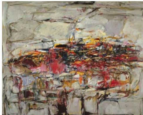
Fig. 15 City Landscape 1955 oil, canvas

Edward Hopper was one of the most important realist painters, and was the only one who created intriguing paintings of the American streets scene. He had a unique and selective vision when portraying an empty cityscape, while capturing the mood and the feeling of the 20th century such as 'Early Sunday Morning' (Fig.16), a painting of a peaceful scene of a closed small business. His painting appears as a picture of New York or an image of America. He had painted the architecture of the buildings to look like basic industries such as selling shoes and clothes. The dark passage in the upper-right corner of the picture is the large side of the building next to the sunny block (Edward Hopper, n.d.). Hopper said that he is "always using nature as the medium to try to project upon canvas my most intimate reaction to the subject as it appears when I like it most; when the facts are given unity by my interests and prejudices. Why I select certain subjects rather than others, I do not exactly know unless it is that I believe them to be the best mediums for a synthesis of my inner experience." He created many paintings that deal with the line of city block buildings, while architecture plays a main role in his work. He admitted saying "I was always interested in architecture, but the editors wanted people waving their arms." Thus, his buildings are protagonists that show embodiment cultural and social concepts.