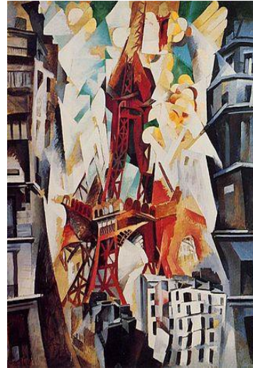
Fig. 14 The Red Tower 1911-160.7 x 128.6 cm