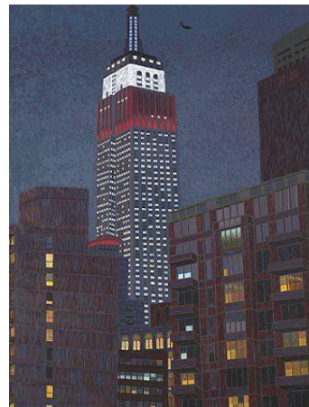
Fig. 23 Empire State Building II, 2009. Oil on canvas