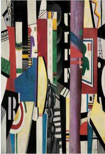
Fig. 13 the City (La Ville), 1919 oil on canvas, 231.1 x 298.4 cm