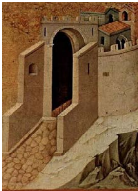
Fig. 3 (detail) Road to Emmaus appearance 1308-1311

Cityscapes were current during the Middle Ages but used to appear as a background for biblical themes and portraits rather than having a specific role in the painting composition. However, in the late 13th and 14th century, painting started to be influenced by it, thanks to Duccio da Buonisegna (National Gallery of Art, n.d.) and his 'Road to Emmaus appearance' (Fig.3) and also Giotto di Bondone's 'Legend of St Francis' (Fig. 4) (Giotto, 2017). It is often thought that Ambrogio Lorenzetti has painted the first true cityscape 'The Allegory of Good Government' (Fig. 5). That painting sparked a remarkable tradition in Italy and Northern Europe and after that, artists continued to paint the city in the background of many paintings.