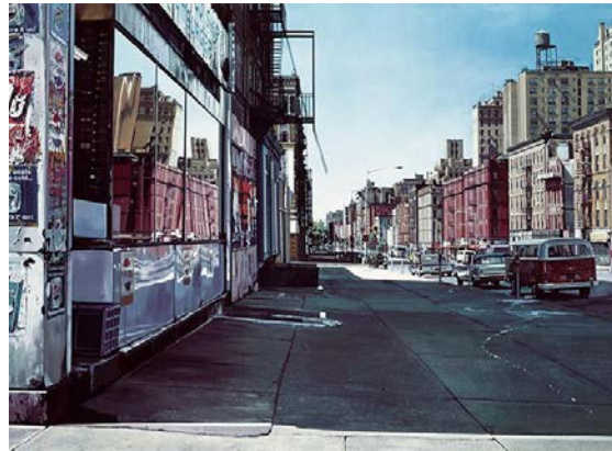
Fig. 21 Columbus Avenue at 90th Street - (1974) by Richard Estes

sites while giving it life. His ‘Columbus Avenue at 90th Street’ (Fig. 21) is one of his most famous cityscapes that presents perspective and reflection in a symmetrical composition and a panoramic view. The bright sunlight and deep shadow plays an important role in many of his cityscapes, while the foreground of the painting have shadows and the bright sunlight areas draw the distance, increasing the sense of depth (Five Richard Estes paintings you should know about, n.d.). Besides that, his storefront creates reflection images. “The city as both a reality and an abstraction becomes the subject of the painting. Hyperreal in its detailed perfection, it evokes the city as an ideal.” He might have focused on the urban environment by avoiding the inclusion of any citizens in his scenes, as “The city is a construct of mankind yet humanity can seem eerily absent from Estes’s urban landscapes of the 1970s and 1980s.”