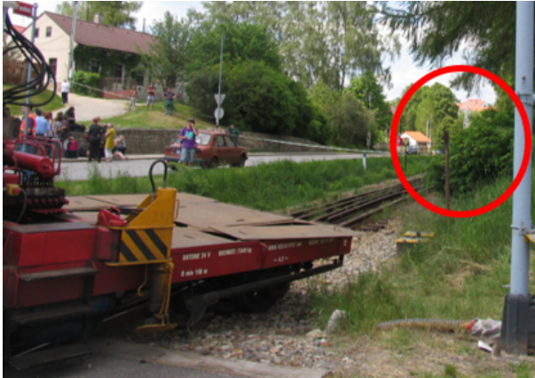
FIGURE 1. Vegetation Intruding Visibility Splays on Level Crossing.

Visibility splays are defined in design standard CSN 73 6380, which is legally binding on the basis of regulation No. 177/1995 Sb. This standard explains how to correctly determine visibility splays, however it has one issue. According to the Paragraph No. 88 of this regulation, above mentioned standard CSN 73 6380 is not binding for level crossings, which project documentation was approved before this standard came into effect. Vast majority of railway was designed and built in the end of the 19th century and in the first half of the 20th century. Visibility splays on these older railways are defined by internal regulation of a railway operator SZDC S 4/3. Calculations are in the principle similar to methods used in design standards and are based on physical principles, however in the end of the regulation S 4/3 it is allowed to reduce visibility splays by half. This statement is based on the theory of probability and enables to reduce visibility splays in the case of a low probability of a collision, which implies on level crossings with low operational speed on the line along with low traffic volumes. However with this statement cannot be agreed either from the scientific view or from the human view. It is essential to respect physical laws and give driver enough time to decision, reaction and for safe crossing of a level crossing [3, 4].