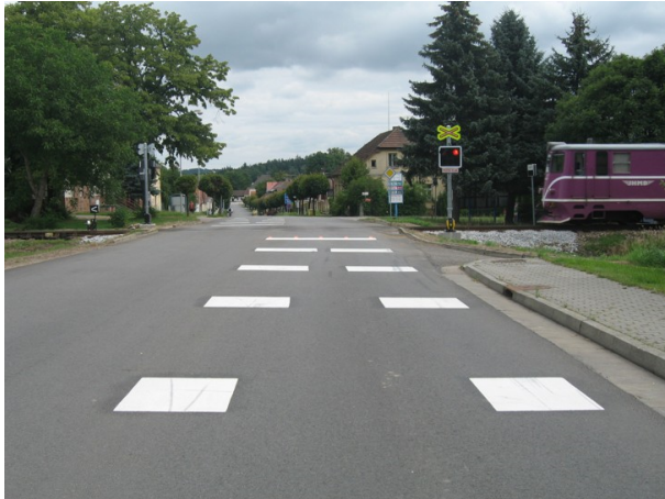
FIGURE 3. Level Crossing Highlighted by 'light bar' and Optical Psychological Brake.

knows, that it usually takes a long time before the train approaches level crossing after the warning light came on. This situation is particularly dangerous for the next people in a row, because human psychology works like 'He made it, so will I'. These people enter the level crossing following the example they have seen and tragedy is near.