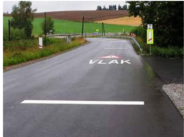
FIGURE 2. Level Crossing Highlighted by Optical Psychological Brake V18.

"Additionally it is used on intersection to mark out where vehicle has to stop to give way, in front of the controlled pedestrian crossing and alternatively also in front of the level crossing" [5].