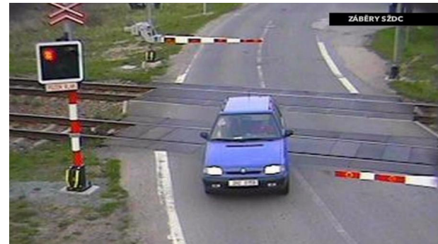
FIGURE 4. S-manoeuvre [6].

Second cause of dangerous situation is when driver is closed between the safety barriers. But this mistake does not have to be fatal. First option is that second passenger can raise the barrier or the barrier can be lifted up by the bonnet of a car. Barriers are intentionally balanced, that only a minimal strength is required to raise them. Second option is breaking the barrier with a car. Every barrier is designed to be easily broken by impacting on it in horizontal direction. It is necessary to raise public awareness about