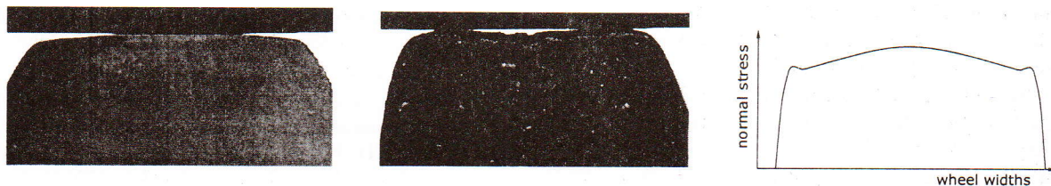
Fig. 3: Surface after impact of water (left) and sand (middle); normal stress distribution in the contact area

The abrasion mechanisms are structured in two types: abrasive wear and chemical corrosion reactions. These abrasion types can also occur in combination, but under special circumstances the interacting effects absorb each other. This is shown by the results of the experiments in which water and sand were used as a two-phase intermediate material. When examining the abrasion in greater detail, we can see that the tangential stress in the bandage surface is crucial to the expected level of wear, because the crack propagation is greatly affected by the stress distribution in the surface. In the chemical corrosion of the bandage, on the other hand, the slip plays a decisive role. Since the slip is significantly affected by the process of the normal stress, it is expected that the maximum abrasion, due to chemical corrosion, occurs at the edges. The reason for this is the occurrence of a lower normal force under an equal elastic deformation, so that the surface at that particular location starts to slip earlier.