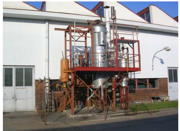
Figure 1: The BIOFLUID 100 experimental gasification unit [8]

detailed description of our experimental unit can be found in earlier studies published by our institute. The main purpose of the experimental measurement was to establish the potential for thermal gasification of crushed furniture chipboard. As this is not a conventional fuel, the initial measurements aimed mainly at finding and verifying a suitable gasification method for this material. The tests focused on the process of gasification proper of the material, to see whether there are any process limitations. [3]