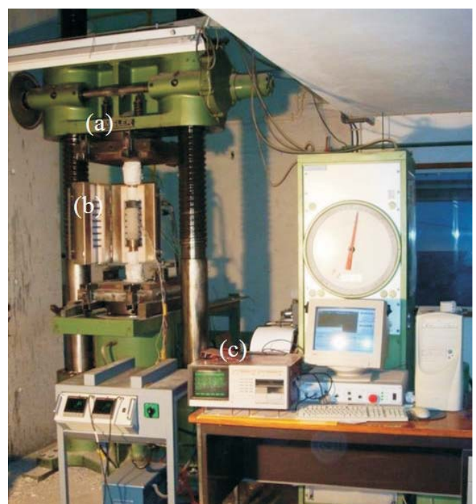
Fig. 1: Test system

The test procedures followed the RILEM TC-200 HTC recommendations [5]. A load equal to 70 % of the design value of concrete compressive strength at room temperature ( 0.7 f_{cd} ) was initially applied to the specimen. When the load level was reached, the specimen was heated at a rate of 3 ^{\circ}\text{C}/\text{min} , until the desired level of temperature was reached. Three maximum temperatures were tested: 300 ^{\circ}\text{C} , 500 ^{\circ}\text{C} and 600 ^{\circ}\text{C} . The temperature was deemed to be reached when the average temperatures registered by the three specimen thermocouples on the surface matched the temperature of the furnace. The specimen was then kept at that temperature for an hour to stabilize. The temperature difference