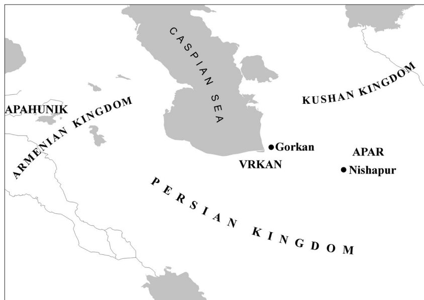
Fig. B.1. Historical geographical place-names related to the earthquake of 454 A.D.

454 in the vicinity of Nishapur in the land of Apar, according to Lazar Parpetsi. Yeghishe (1971) wrote: «By the midnight, horrible sounds were heard again, and thunder-like rolls (that reached us) from beneath resembled earthquake rumble, the earth trembled under their feet, and sparkles from the glare of swords were flying around them».