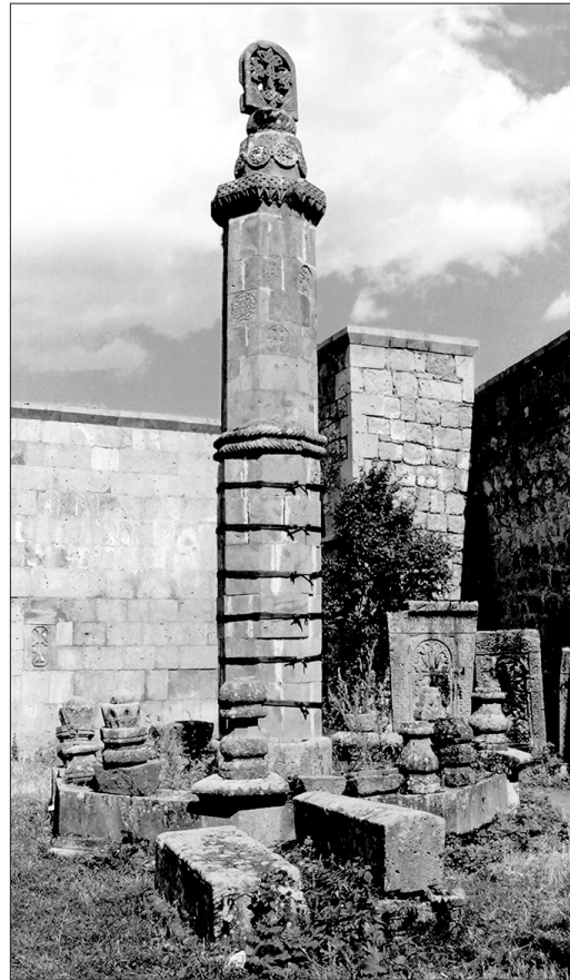
Fig. 3. Gavazan obelisk in the Tatev Monastery, situated in the south of today's Armenia.

The 1931 earthquake with estimated intensity 9 in the area of the Tatev Monastery (MSK-64) destroyed its churches, and had macroseismic impacts on the «Gavazan» obelisk similar to those recorded in 1406 (Gorshkov, 1932, 1933; Karakhanian et al. , 2003). Apart from destruction in the Tatev Monastery, the 1931 earthquake caused damage to the «Vorotnavank Monastery», and severe destruc-