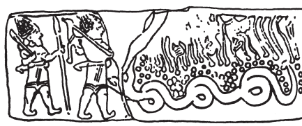
Fig. A.1. Bas-relief found in the city of Malatya, the southeastern Turkey: a god fighting a dragon (Gurney, 1966).