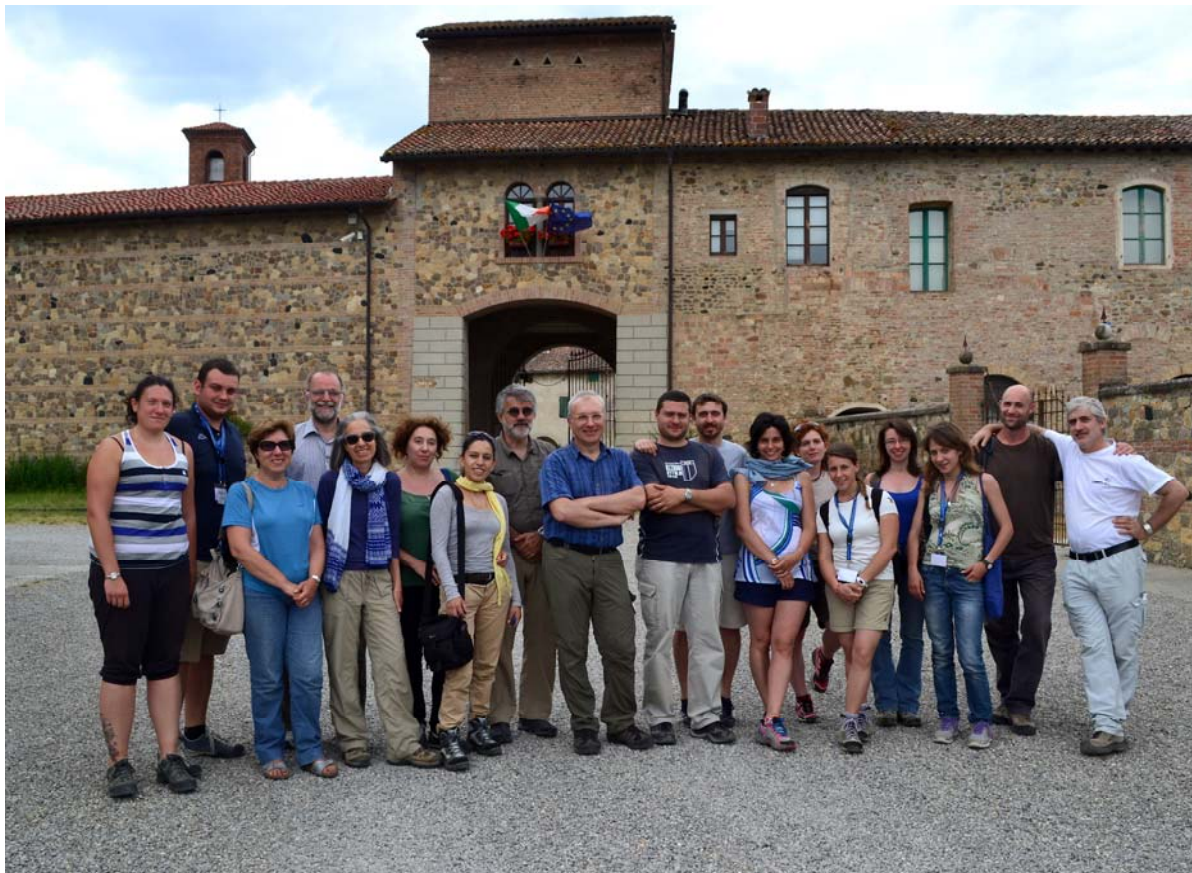
Fig. 5 - Group photo of part of the participants to the AEOMED workshop.

To summarize, although the loess deposits and loessial soils in each site were slightly different, the main sedimentological and pedological characteristics are similar mainly in their stratigraphic appearance, particle size distribution, and mineralogy. In places where the loess was not buried by fluvial or fluvio-glacial sediments and was subject to continuous pedogenic processes the loess is more weathered and more clayey. This arises the possibility that the loess in the Po Plain is derived from the same local sources, which might be the Po flood plains and the Po influents, which were exposed during glacial time for long periods and were subject to intense winds at that time. Possibly, the combination of increased wind strength with availability of sediments allowed the formation and/or transportation and deposition of loess over a large area, from