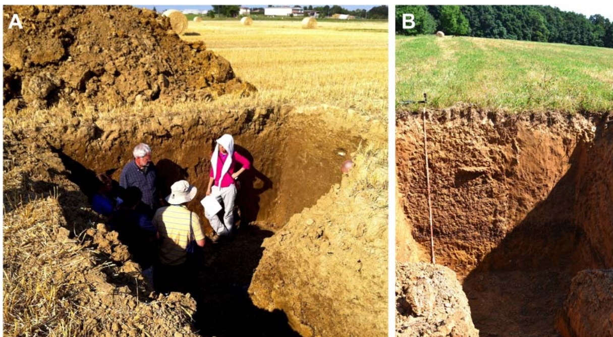
Fig. 4 - Loess sequences at the southern fringe of the PPLB: (A) the participants discussing the significance of loess and paleosols at the Ghiardo site; (B) the loess sequence at the Boschi di Carrega site. Note in (B) a deep and dark horizon with high concentration of Mn concretions.

Firenze and CRA-ABP, allowed opening new trenches and soil pits at each study site.