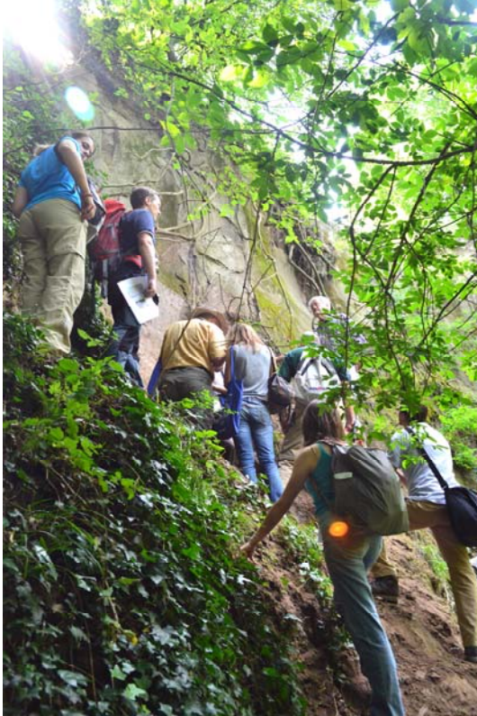
Fig. 2 - The participants to the workshop visiting the Val Sorda sequence.

standing of the mechanisms of dust and loess generation, transportation and deposition. Short term aims of AEOMED Project for the following two years (2013-2015) are: (i) to reconsider the loess in northern Italy, mainly the Po Plain loess; (ii) to study loess sites with non glacial aeolian loess deposits, specifically loess and dust derived from the Sahara desert in sites at the central and southern Italy; (iii) to map the loess in Italy along a north-south climatic transect. This project will contribute to identify sources of recent and palaeo-dust/loess around the Mediterranean Sea and to evaluate rates of loess/dust deposition in the context of palaeoclimate reconstructions, and soil formation processes.