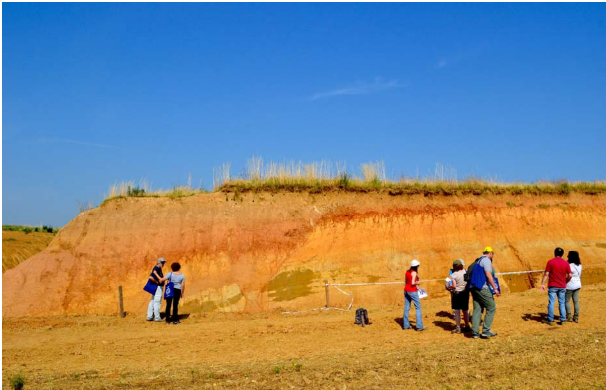
Fig. 3 - A detail of the loess/paleosols sequences deformed by a gravity graben at Monte Netto; note the thick red paleosol buried by loess.