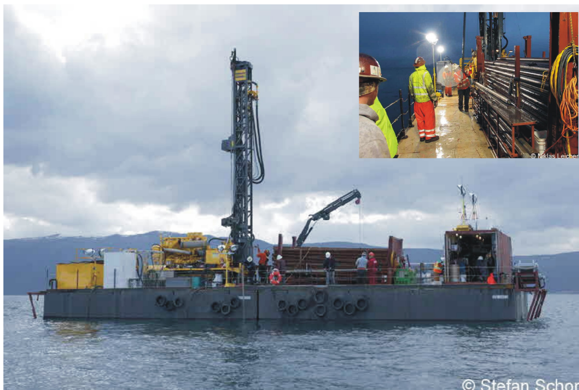
Fig. 1 - Drilling operations at Lake Ohrid (Macedonia, Albania) in the framework of the ICDP-funded project SCOPSCO "Scientific Collaboration on Past Speciation Conditions in Ohrid".

The DOVE workshop (Fig. 2), funded by ICDP,