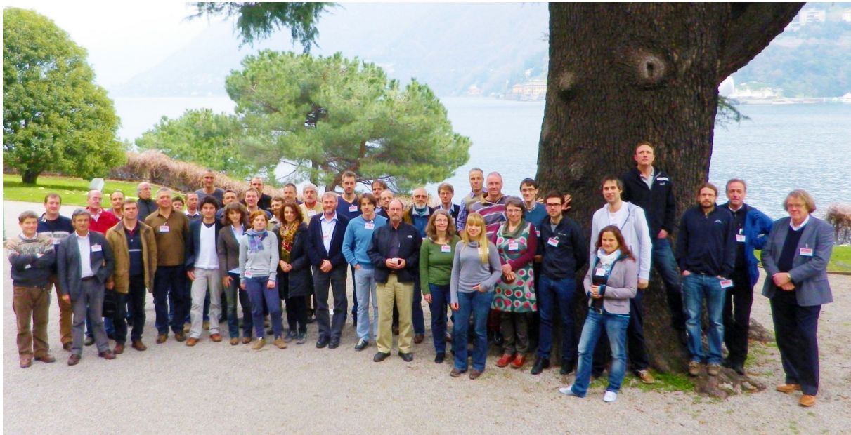
Fig. 3 - Group photo of the participants to the ICDP DOVE Workshop.

the project relies on the interest and support by research agencies, Universities, local and regional administrations, industry groups. Indeed, in case of positive evaluation, ICDP funds will be granted for project and drilling development, while applicants are asked to raise additional resources to fully cover drilling costs, facilities, scientific data production and management.