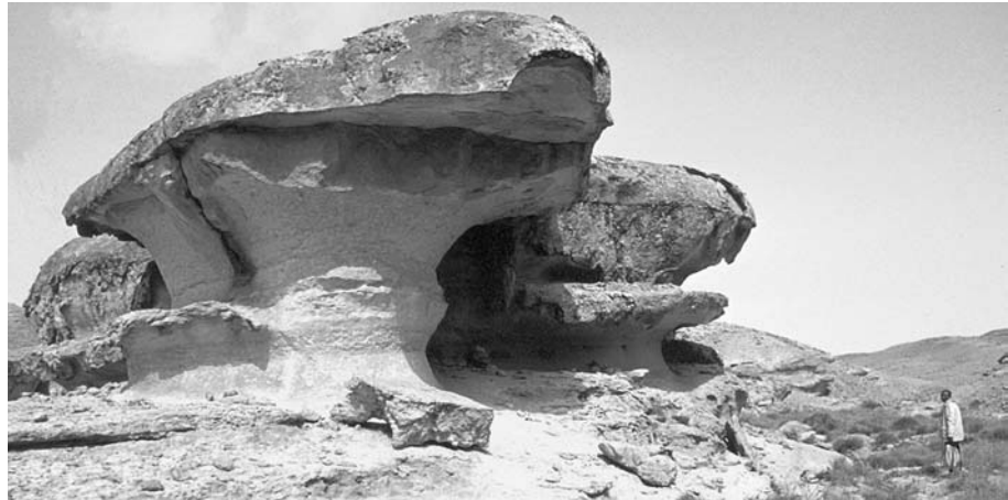
Fig. 5- Beautiful example of mushroom-like meteoric selective erosion rock sculpture in the Ben Hamed gorge.

This study has been carried out with the financial aid of the Sardinian Regional Government in the fra-