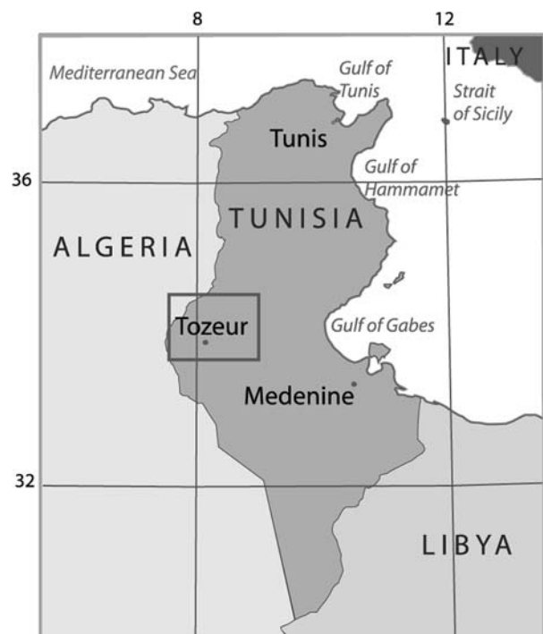
Fig. 1 - General location of the study area.

Tozeur is located in south-western Tunisia, between the two salt lakes Chott El Djerid to the south and Chott El Gharsa to the north (Fig.1).