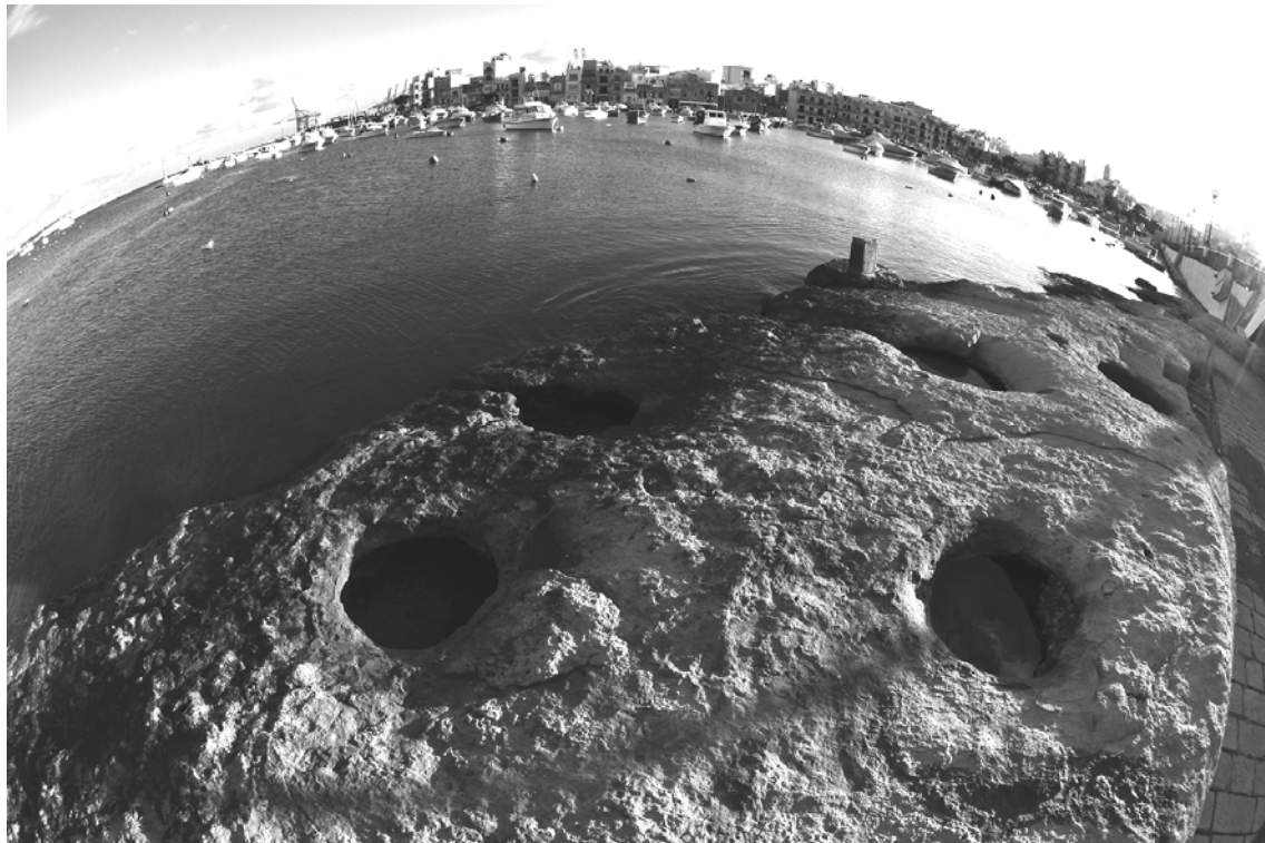
Fig. 2, The pits at St. George's Bay, Birzebbugia, S Malta. Le strutture archeologiche presso St. George's Bay, a Birzebbugia, nella parte meridionale di Malta.