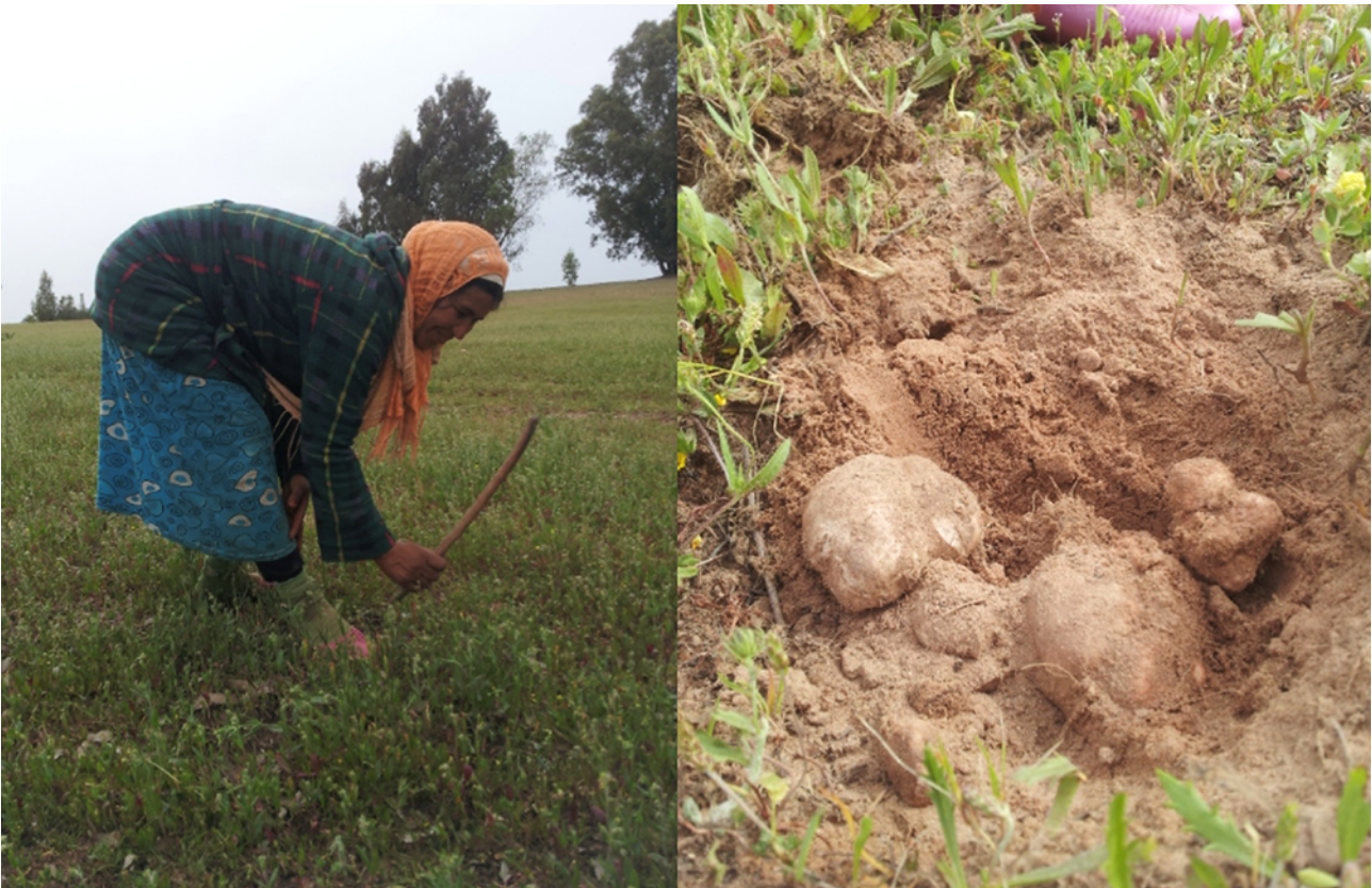
Fig. 2 Desert truffles ( Terfezia arenaria ) being located in Morocco using the “stick” method (left) and freshly unearthed fruiting bodies (right). The photographs were taken by the corresponding author.