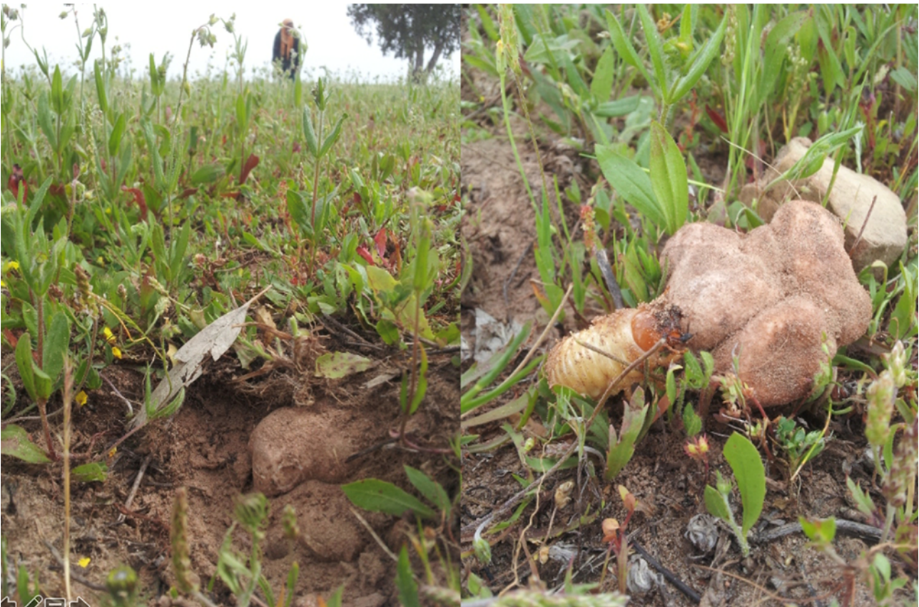
Fig. 3 Desert truffle ( Terfezia arenaria ) in the soil (left) in Morocco and an example of larvae (unidentified) that are occasionally found in close proximity to the fruiting body (right). Note: these larvae do not seem to damage the truffle, but may benefit from the locally elevated moisture levels.