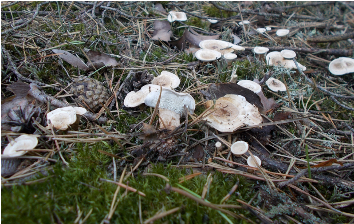
Fig. 3 Sporocarps of Phellodon tomentosus recorded in high abundance in Cladonio-Pinetum in the “Bory Tucholskie” National Park.

2, IX 2014, IX 2015; CP 3, IX 2014, IX–X 2015; f.s. 19, X 2016; f.s. 28, X 2014, IX 2015; f.s. 31, IX 2015; f.s. 32, X 2016; f.s. 33, IX 2015; f.s. 41, X–XI 2015, X 2016; f.s. 42, IX 2014, IX–X 2015.