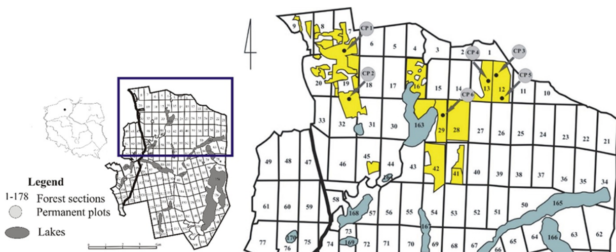
Fig. 1 Localization of permanent plots of Cladonio-Pinetum in the “Bory Tucholskie” National Park, protective district Drzewicz [from: Salamaga et al. (modified) [22] and BG].

The material included macromycetes collected in the vegetative season in 2014 to 2016. Observations were carried out once a month (April–November), with a total of eight observations made each year. The study included all patches representing the most typical fragments of the community. Field investigations began with recognition of the habitat and locations where permanent plots were established. The range of occurrence of the habitat was established by Solon and Matuszkiewicz [4] and Matuszkiewicz et al. [5], who determined six permanent observation plots measuring 10 × 100 m (10 acres) and gave them the names CP 1 to CP 6 (Fig. 1). CP 1 is located in Forest Section 7, in a pine tree stand. The area has a slight incline, and the undergrowth is covered compact layer of Cladonia spp. Between these are mosses, namely Pleurozium schreberi and Dicranum spurium , and small quantities of deadwood (i.e., branches, logs). CP 2 is Forest Section 32, which is in a pine tree stand, with young pines in the undergrowth.