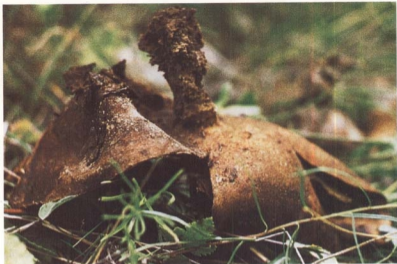
Fig. 3. Geastrum melanocephalum in the forest community resembling the dry form of the Viola odoratae-Ulmetum association in the Bielinek Reserve on the Odra river