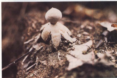
Fig. 4. Geastrum minimum in the xerothermophilous sward Linosyridi-Stipetum in the Bielinek Reserve on the Odra river