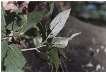
Fig. 3. Ramularia concomitans Ell. et Holw. on Bidens tripartita