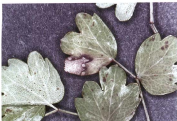
Fig. 5. Ascochyta actaeae (Bres.) J. J. Davis on Thalicttrum minus