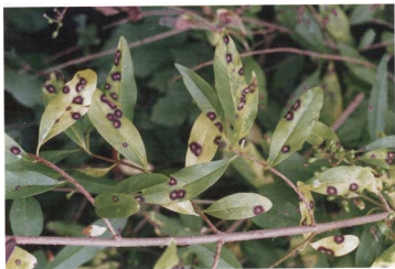
Fig. 4. Thedonia ligustrina (Boerema) Sutton on Ligustrum vulgare