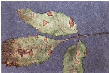
Fig. 2. Puccinia dentariae (Alb. et Schw.) Fuck. on Dentaria enneaphyllos