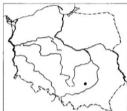
Fig. 1. Locality of Tulostoma melanocyclus in Poland

Agropyron intermedium 4.5, Achillea pannonica +.2, Adonis vernalis +, Arenaria serpyllifolia +, Asperula cynanchica 1.2, Coronilla varia +, Euphorbia cyparissias 1.1, Gypsophila fastigiata 2.3, Helianthemum ovatum 2.3, Medicago falcata 1.2, Pimpinella saxifraga +, Poa compressa +.2, Potentilla arenaria 1.2, Scabiosa ochroleuca +, Thymus marschallianus +.2, Abietinella abietina d 1.2, Cladonia sp. d +, Dermatocarpon hepaticum d +, Bryum caespiticium d 1.2.