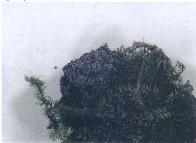
Fig. 14. Physarum gyrosom .