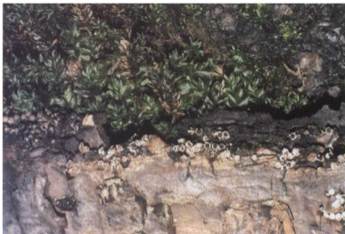
Fig. 7. Diderma radiatum .