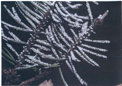
Fig. 13. Physarum cinereum .