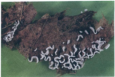
Fig. 12. Physarum bivalve .