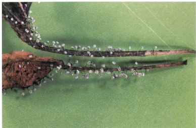
Fig. 9. Didymium nigripes .