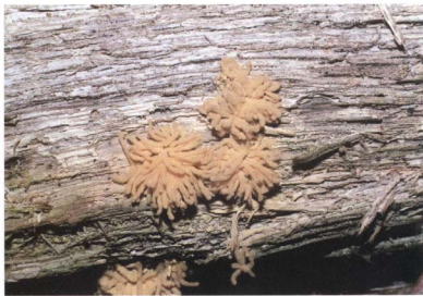
Fig. 4. Arcyria obvelata .