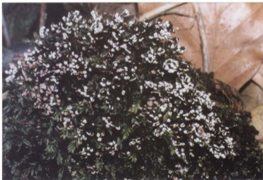
Fig. 8. Diderma testaceum .