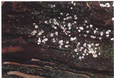
Fig. 6. Diderma deplanatum .