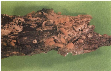
Fig. 3. Arcyria minuta .