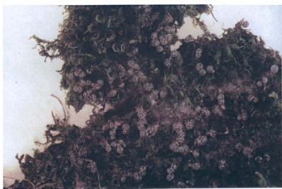
Fig. 11. Lepidoderma tigrinum .