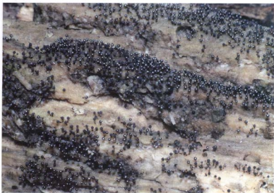
Fig. 15. Lamproderma arcyronema .