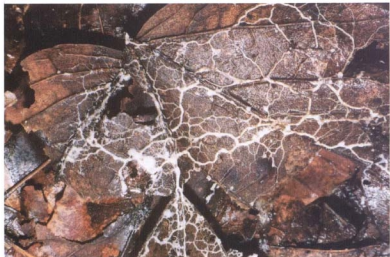
Fig. 1. Plasmodium of Diachea leucopodia .