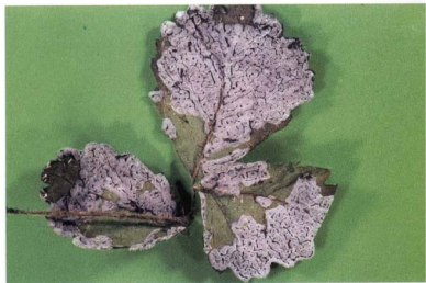
Fig. 10. Didymium serpula .