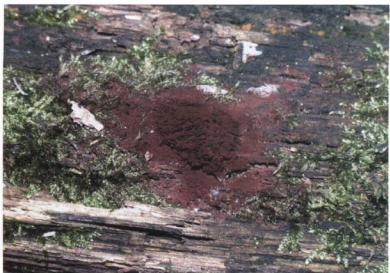
Fig. 16. Symphotocarpus flaccidus .