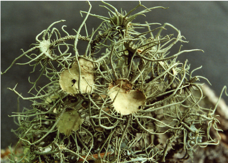
Fig. 2. Habit of Usnea florida from Site I (Kościelniak, KRAP-L).