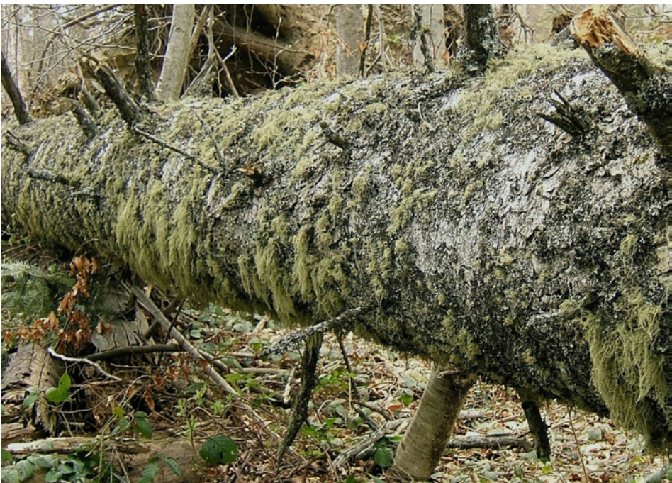
Fig. 3. A blown-down tree-trunk covered with Usnea ssp.