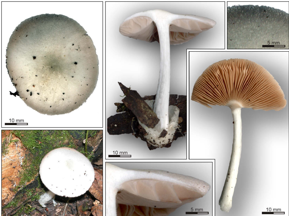
Fig. 2. Fruitbody of Volvariella caesiotincta recorded in Wrocław (22. July 2002; photo and scans by M. Halama).