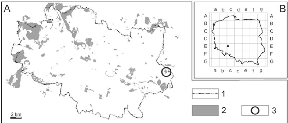
Fig. 1. The location of the Volvariella caesiointincta : A – site in Wrocław; B – in Poland (based on a 100 km ATPOL grid); 1 – urban boundary, 2 – municipal forests and parks, 3 – locality of the species.

2003 and July 2004, but no V. caesiointincta carpophores were observed. The location of the species has been carefully marked and will be monitored in the future.