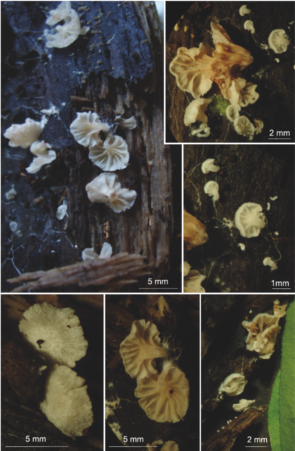
Fig. 2. Fresh carpophores of E. jahni (phot. M.Nita).