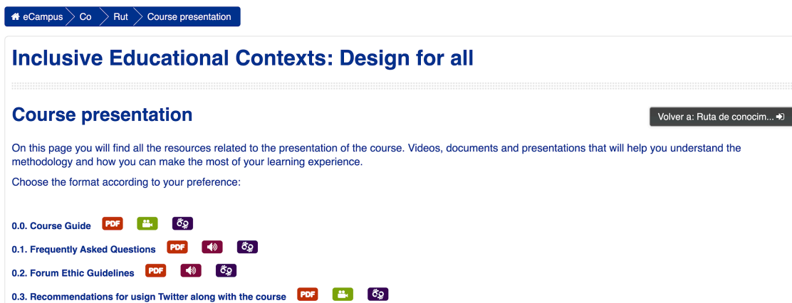
Figure 3. Resources in multiple formats identified with icons

For this reason, we used resources with accessibility features to better present the content.