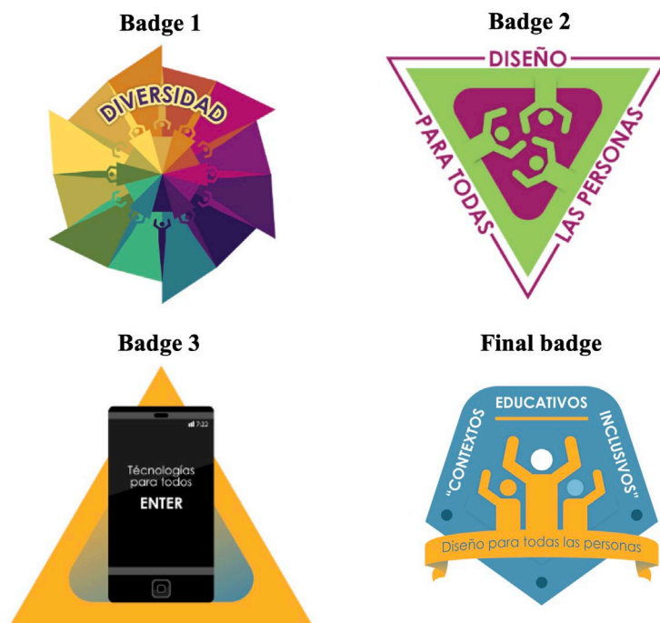
Figure 6. Course badges

Gamification was employed by means of Moodle badges obtained by completing the self-evaluation questionnaires (see Figure 6). Each badge represents the successful completion of the three modules. After completing the activities in Module 1 and demonstrating an understanding of the concept of diversity, the participant earns the first badge. In order to obtain the second badge, the participant has to pass Module 2, on the theme of design for all. And the third is obtained by learning about technologies for all. On the other hand, the final badge is obtained at the end of the three modules of the course. Awarding badges for performing successful activities or tasks is a gamification technique. It is a form of feedback that indicates student progress, contributing to their motivation, while motivating them to participate (Pilkington, 2018).