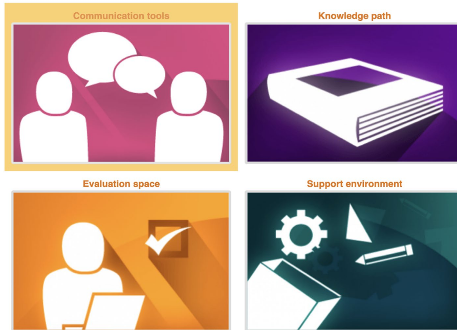
Figure 2. Environment for Moodle courses

The University of Atlántico has improved its infrastructure, creating the institutional conditions for integrating ICT. One of the tools provided is the SICVI 567 platform (Moodle). We are continuously working on its improvement, for example, its interface, task automation, and safety. In the near future, the institute plans to present the MOOC-UA platform, also based on Moodle for the distribution of MOOCs, in conjunction with the IT Department through the Virtual Education Project and supported by the Faculty of Education Sciences.