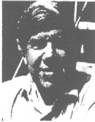
• Stephen Jay Gould Harvard Biologist and President-Elect, American Association for the Advancement of Science