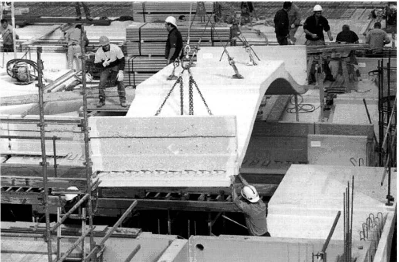
On-site insertion of a precast concrete curved beam ceiling panel

Meanwhile, natural ventilation will cool the building at night. Windows on the north and south façades will open to allow fresh cool air to enter the offices, flush out warm air and cool the exposed ceilings of the building. This is called night purging. Sensors will close the windows when they detect high winds and rain or higher temperatures.