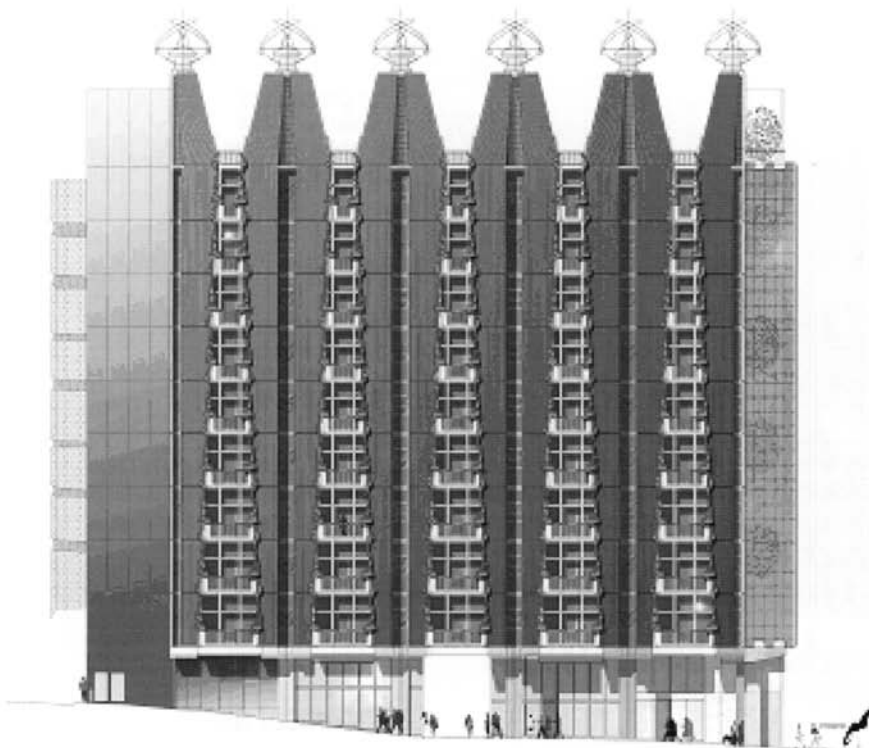
a. Diagrammatic North Elevation