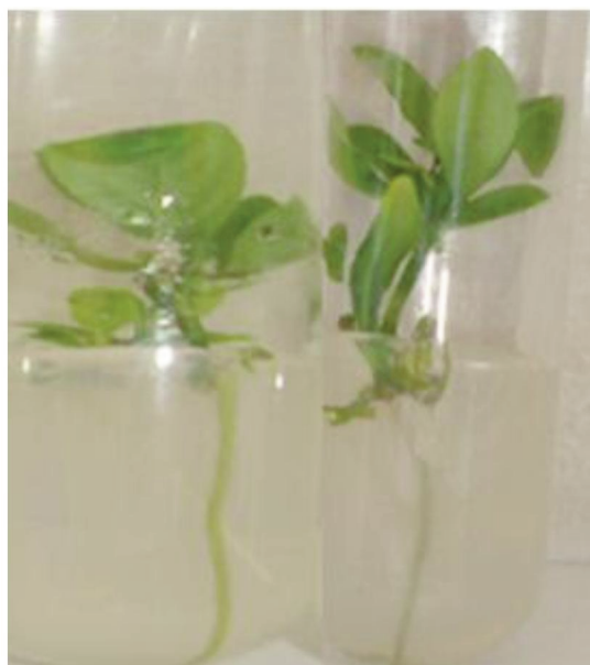
Fig. 2 - Rooting of the Mexican lime adventitious shoots.

The results are based on eight replications and one explant per replication. In each column, means followed by different letters differ significantly at P≤0.05 according to Duncan's multiple range tests.