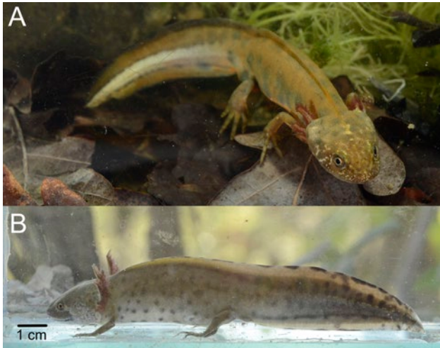
Fig. 1. Paedomorphic individuals of T. carnifex . (A) Male from SF; (B) Female from AN. Scale bar refers only to picture B.

persion to other breeding sites, thus preventing gene flow and giving rise to inbreeding phenomena (Whiteman, 1994). However, facultative paedomorphosis is a plastic process and paedomorphic individuals are able to metamorphose in the presence of challenging environmental conditions like desiccation (Denoël, 2003).