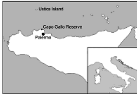
Fig. 1. Study area.

at 100 m a.s.l., is a concrete basin built in the depression of a natural temporary pond. It fills up partially to reach a maximum surface area of about 100 m 2 and a maximum depth of 60 cm. The landscape surrounding the water bodies consists of cultivations and grassland. The two ponds are about 3 km apart.