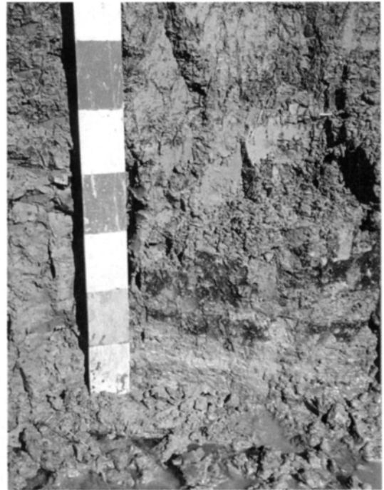
Fig. 3. The Ylistaro pedon from 0.80 m below.

originally in the soil or formed upon drying and partial oxidation of sulfide, probably results in a slight overestimation of CEC and underestimation of base saturation in the most acid ( \text{pH} < 3.5 ) horizons and in the horizons containing sulfidic materials. Possible presence of free sulphate salts also adds to the overestimation of CEC. Poorly crystalline Fe and Al (hydr)oxides were extracted with 0.2 M \text{NH}_4 -oxalate ( \text{pH} 3.0 ) in the dark (McKeague and Day 1966). Iron and Al were determined by ICP.