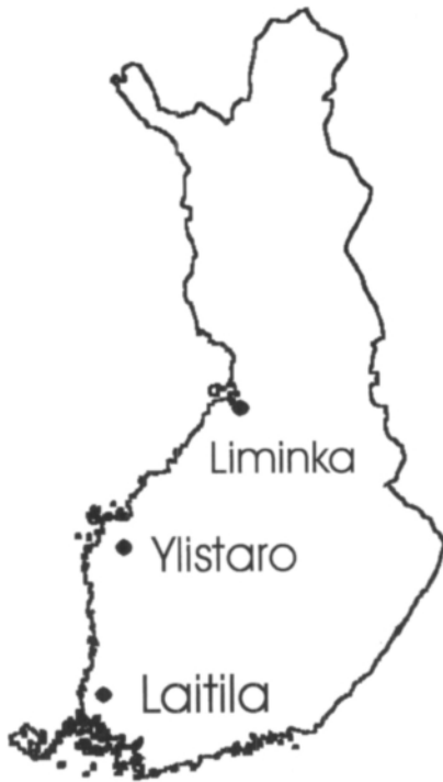
Fig. 1. Locations of the pedons.

fore sampling. At the same time, the sampled plot was pipe-drained to the depth of 113 cm and limed (15 tons dolomitic limestone ha -1 ). Oats had been grown in the field for three years, after which cropping was abandoned and the area was now covered with a grassy vegetation. Ground water was at 95 cm below the soil surface on August 14, 1992.