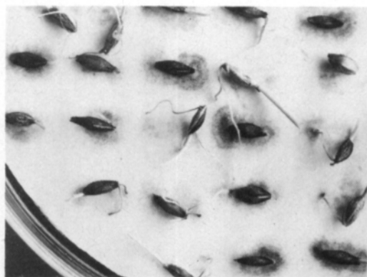
Fig. 1. A barley seed sample cv. Paavo with very high incidence of Bipolaris sorokiniana after 5 days of incubation in a petri dish.