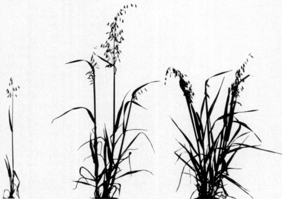
Fig. 3. Silhouettes of oat plants at or shortly after the anthesis. — To the left: Hannes. — In the middle: HA 68—2 grown at the density of 4 \times 17.5 cm. — To the right: HA 68—2 grown at the density of 8 \times 25 cm. The tillering is excessive and the appearance of the panicles partial.