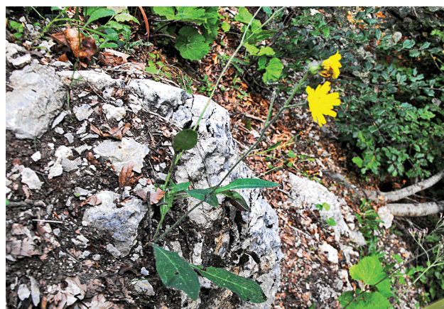
Fig. 3. Hieracium pollinense on the locus classicus.

Conservation status. Only one site is currently known for Hieracium pollinense within the Pollino National Park. Despite its limited distribution (less than 1 km 2 ) and the low number of plants – in the only know location 40–60 mature individuals were estimated – it does not seem to be currently subject to threats that may cause a decrease of the number of mature individuals. Therefore, according to the IUCN (2014) criteria for the conservation status assessment, H. pollinense should be classified as “endangered” (EN): D.