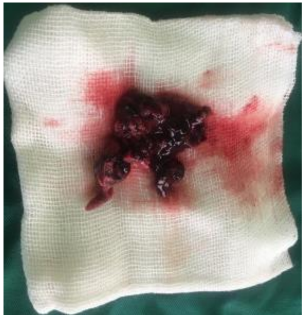
Figure 2: Pulmonary artery clot (left) and right ventricle clot (right) of case 2 extracted via thrombectomy.