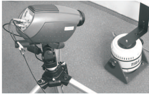
Fig. 2. Infrared camera system for non-contact imaging of stresses in structures. Thermography based measurement of stress for two connected plates.