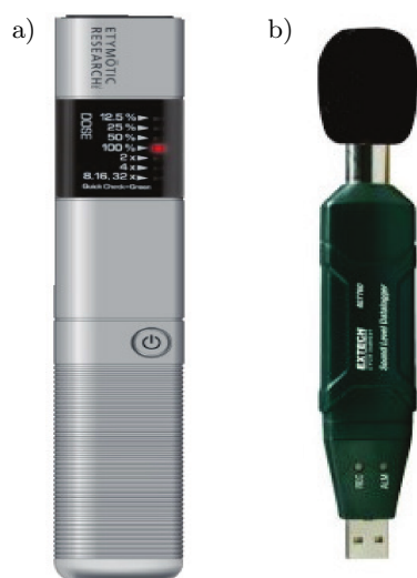
Fig. 1. a) ER-200D Personal Noise Dosimeter, b) Extech Sound Level Datalogger.

In order to assess workplace noise exposure and associated health effects (irreversible hearing damage, psychological and physiological adverse effects) in this specific profession, a full shift noise exposure of 40 teachers from 1 kindergarten, 2 primary and 2 high schools were measured in real condition using, ER-200D Personal Noise Dosimeter (Fig. 1a) and Extech Sound Level Datalogger (Fig. 1b).